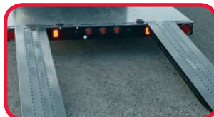
5' Slide-out Ramps