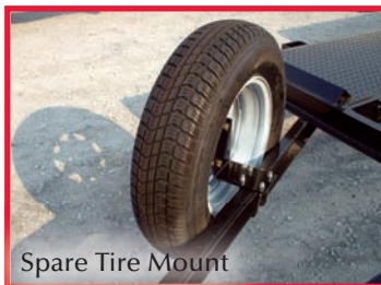
Spare Tire Mount