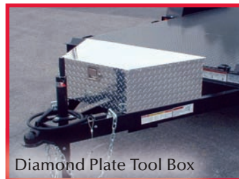
Diamond Plate Tool Box