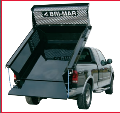
Cab protector optional

Pricing and Specifications subject to change without notification.