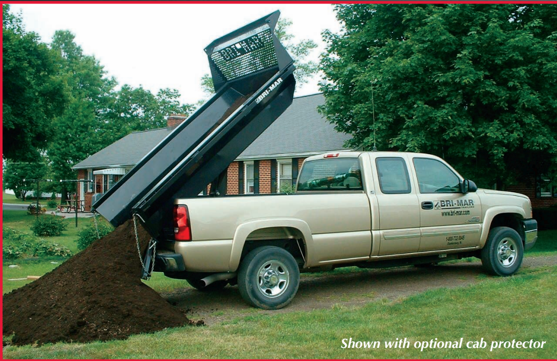
Shown with optional cab protector