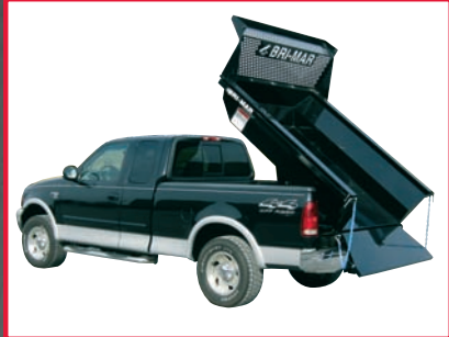
Cab protector optional