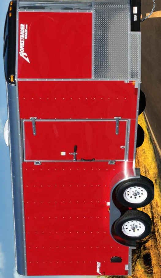
Model 716HT w/ optional Vee-Nose