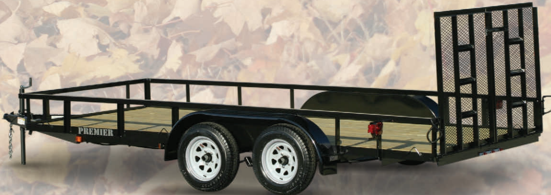
LT Heavy Duty