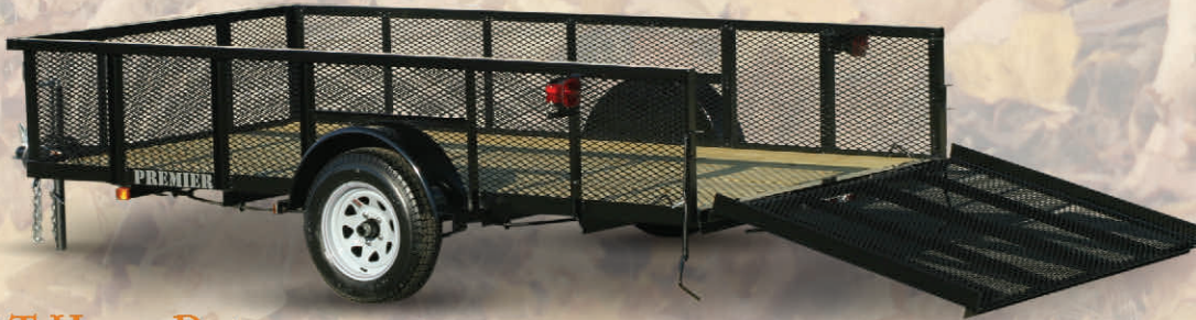
LT Heavy Duty

Versatility Reliability Durability Quality Construction Many Standard Features